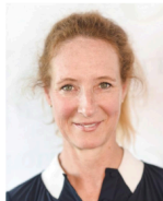
U.S. Olympic Dressage team silver medalist Sabine Schut-Kery.

Sabine Schut-Kery stepped into the international spotlight in the lead-up to and during the 2020 Tokyo Olympic Games, which were postponed to 2021 due to the coronavirus pandemic. She and Sanceo made headlines in the world of dressage when they helped the U.S. Dressage Team win the silver medal. The pair also finished fifth in the Grand Prix Freestyle to Music to become the top-placed U.S. combination individually.